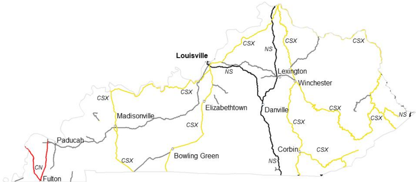
Map is based on the 2022 North American Rail Network published by the U.S. Department of Transportation. Some mileage figures are AAR estimates.

Class I Railroad: A railroad with 2021 operating revenues of at least $943.9 million. Regional Railroad: A non-Class I line-haul railroad that has annual revenues of at least $40 million, or that operates at least 350 miles of road and revenues of at least $20 million. Short Line Railroad: A railroad which is neither a Class I nor a Regional Railroad.