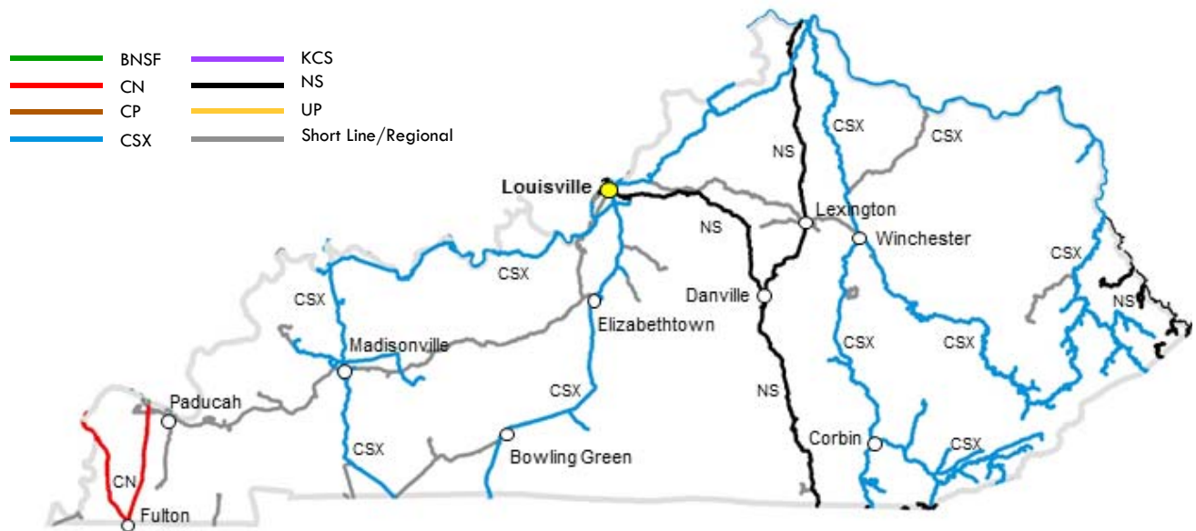
Map is based on the 2016 National Transportation Atlas Database published by the U.S. DOT, Bureau of Transportation Statistics.

Class I Railroad: A railroad with 2015 operating revenues of at least $457.9 million. Regional Railroad: A non-Class I line-haul railroad that has annual revenues of at least $40 million, or that operates at least 350 miles of road and revenues of at least $20 million. Local Railroad: A railroad which is neither a Class I nor a Regional Railroad, and which is engaged primarily in line-haul service. Switching & Terminal Railroad: A non-Class I railroad engaged primarily in switching and/or terminal services for other railroads.