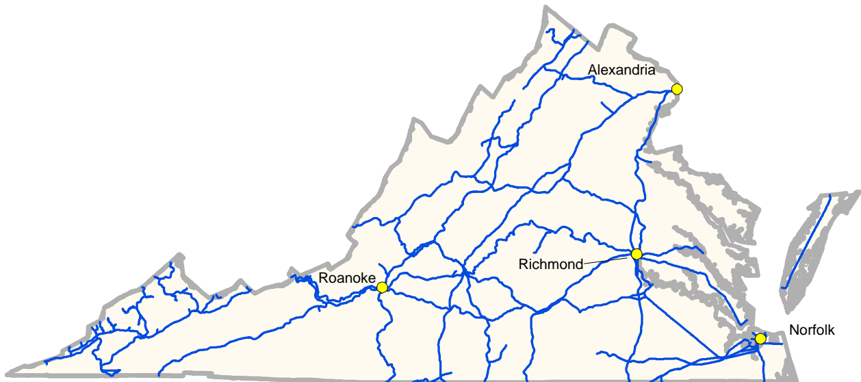
Rail network based upon 2006 National Transportation Atlas Database published by the U.S. DOT, Bureau of Transportation Statistics.

Class I Railroad - As defined by the Surface Transportation Board, a railroad with 2006 operating revenues of at least $346.7 million. Regional Railroad - A non-Class I line-haul railroad operating 350 or more miles of road and/or with revenues of at least $40 million. Local Railroad - A railroad which is neither a Class I nor a Regional Railroad and is engaged primarily in line-haul service. Switching & Terminal Railroad - A non-Class I railroad engaged primarily in switching and/or terminal services for other railroads. Note: Railroads operating are as of December 31, 2006. Some mileage figures may be estimated.