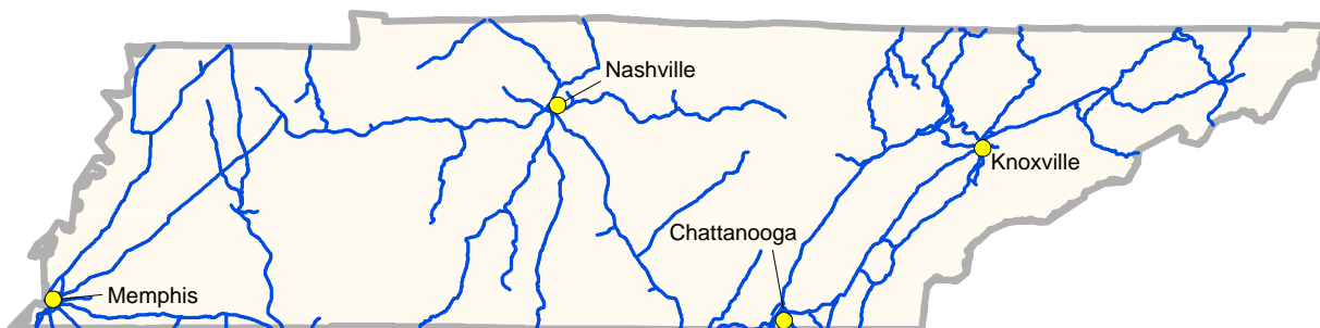
Rail network based upon 2006 National Transportation Atlas Database published by the U.S. DOT, Bureau of Transportation Statistics.

Class I Railroad - As defined by the Surface Transportation Board, a railroad with 2006 operating revenues of at least $346.7 million. Regional Railroad - A non-Class I line-haul railroad operating 350 or more miles of road and/or with revenues of at least $40 million. Local Railroad - A railroad which is neither a Class I nor a Regional Railroad and is engaged primarily in line-haul service. Switching & Terminal Railroad - A non-Class I railroad engaged primarily in switching and/or terminal services for other railroads. Note: Railroads operating are as of December 31, 2006. Some mileage figures may be estimated.